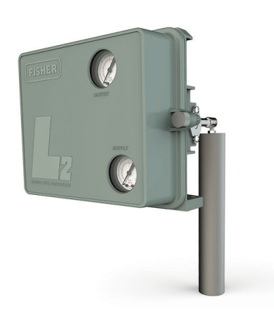
Improved L2 Level Controller