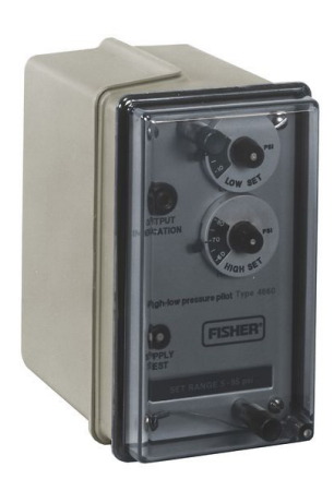
4660 High-Low Pressure Pilot