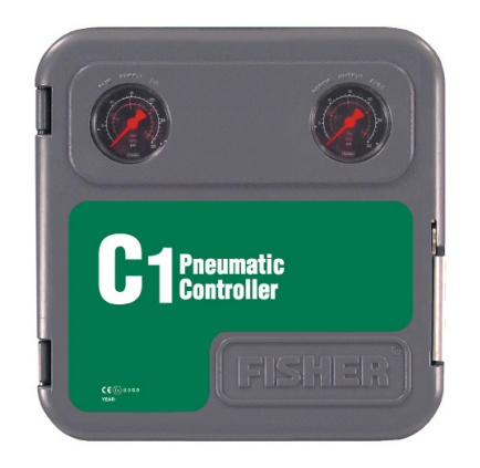
C1 Pneumatic Controller