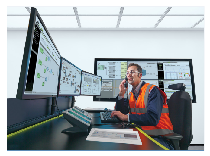
Dynamic Alarm Management Services provide a platform for managing abnormal and normal situations by eliminating alarm floods and meeting recommended metrics.