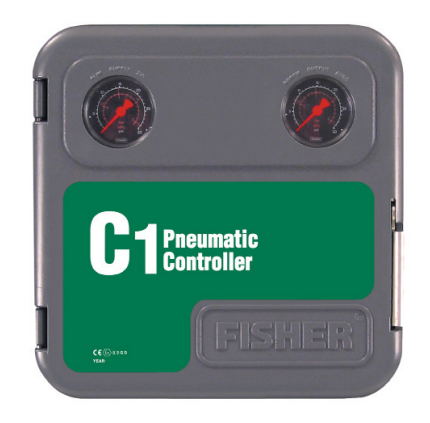
C1 Pneumatic Controller