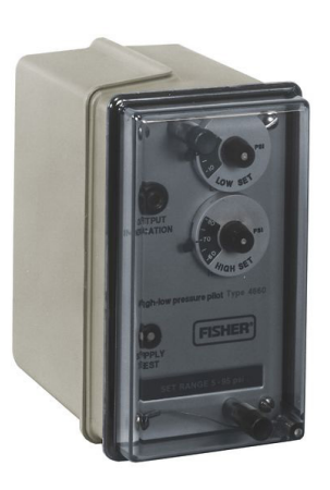
4660 High-Low Pressure Pilot