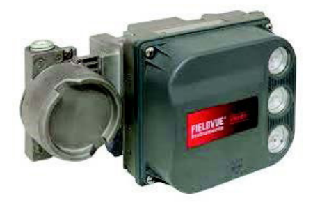
FIELDVUE™ DVC6200 Digital Valve Controller