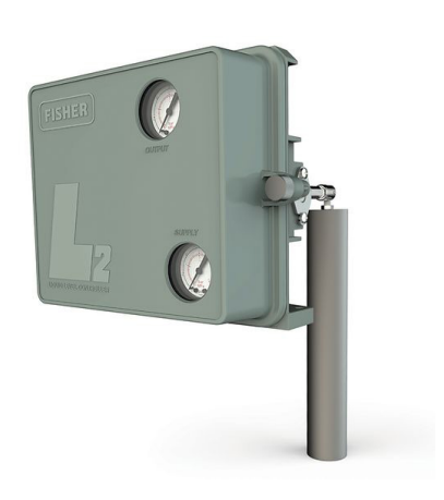
Improved L2sj Level Controller