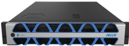
Power 2 Server