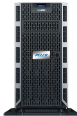
Flex 2 Server