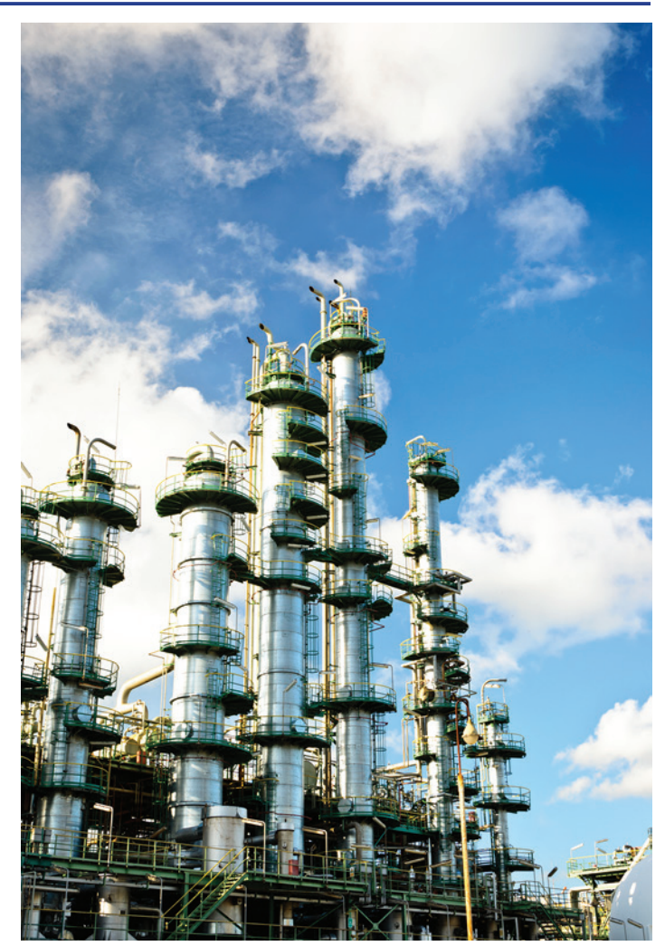
Figure 1. Distillation columns