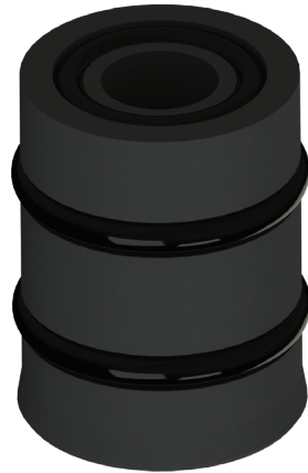
One N' Done Packing

LCO Technologies is at the forefront of innovation with its One N' Done Packing, designed to provide superior performance in chemical injection applications. This proprietary seal is compatible with 5100 series fluid ends and is built to address common issues associated with traditional V-packings.