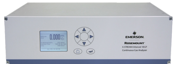
Rosemount X-STREAM Enhanced Continuous Gas Analyzer shown in a 19" rack-mount, general purpose housing.