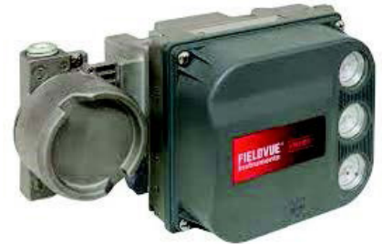
FIELDVUE™ DVC6200 Digital Valve Controller