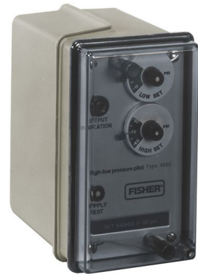
4660 High-Low Pressure Pilot