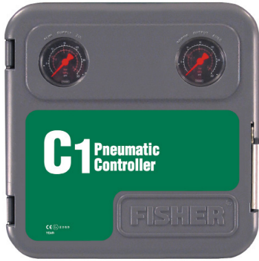
C1 Pneumatic Controller