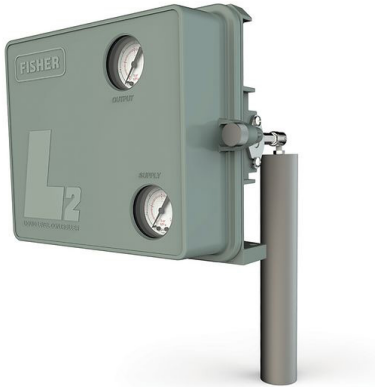
Improved L2(snap) Level Controller