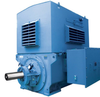
Hyundai Electric Medium Voltage Motor

Hyundai manufactures a wide range of industrial motors, providing Customers with the best motor for their environment and operating conditions. Hyundai's electric motors comply with international standards such as CSA, UL, IEEE841, IEC, API541/547 and NEMA, and are manufactured using state of the art design technology and rigorous production quality control. The result is exceptional performance across process industries such as oil and gas, chemical/petrochemical, mining, pulp and paper, power generation, water/wastewater and manufacturing.