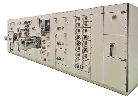
Spartan Controls PowerVUE